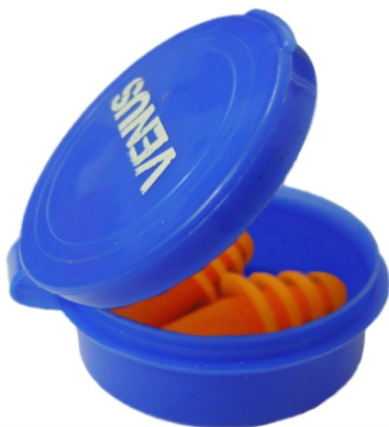
Flip-top Container (*optional)